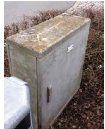
"Blooming" and heavy contamination after several years

Additional handling and logistical effort – for the internal coating system, for example, or for an external contract coater – is no longer necessary.