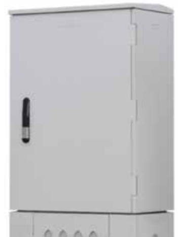
Continuous protection of the SMC components due to PIMC coating

Our experts will gladly visit you to talk about an individual PIMC concept.